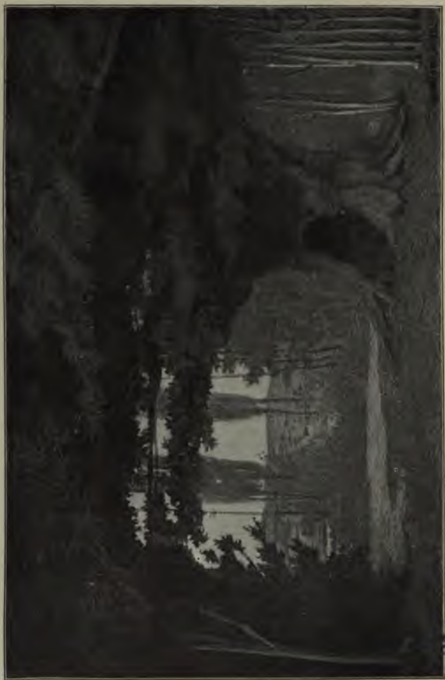
ACT FIRST: "THE LADIES' TREE," NEAR DOMREMY